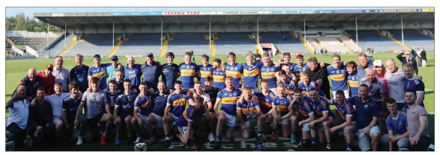
Kiladangan players, mentors and supporters celebrate their first County Senior Hurling win.

Kiladangan had the slight edge in the third quarter and were level, 0-18 to 3-9, at the second water break. It was a close contest during the final quarter and with two minutes left Loughmore